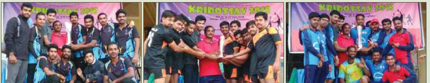
Cricket Winners Team