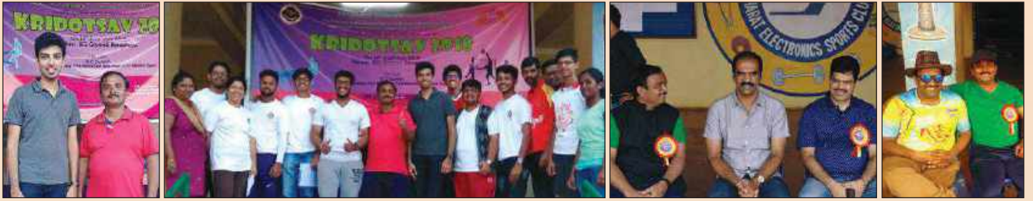
Core Committe members of Sports meet