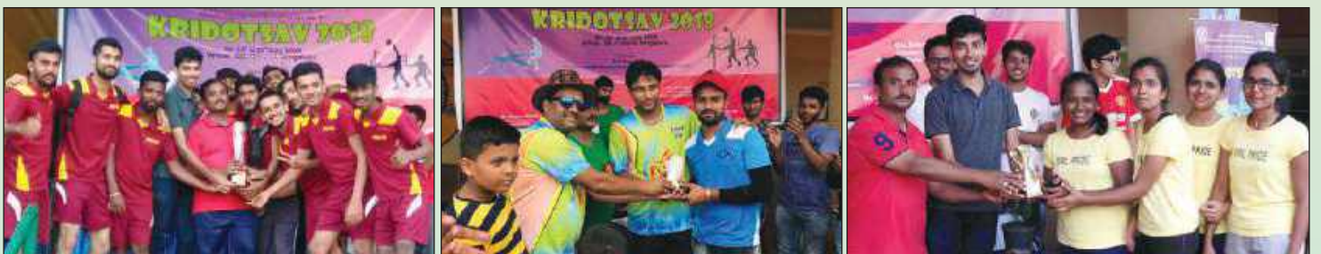
Winners of Kabaddi Team