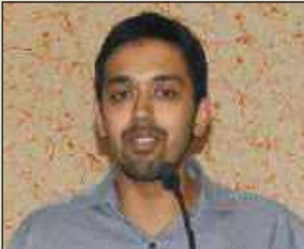
CA. Naga Subramanya