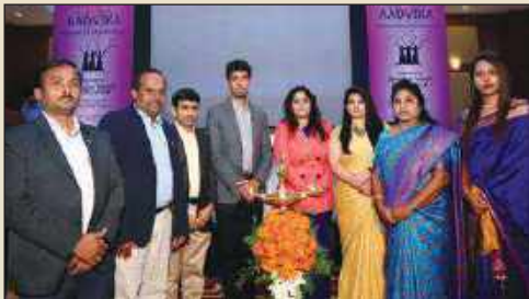
Inauguration of Conference by lighting the lamp